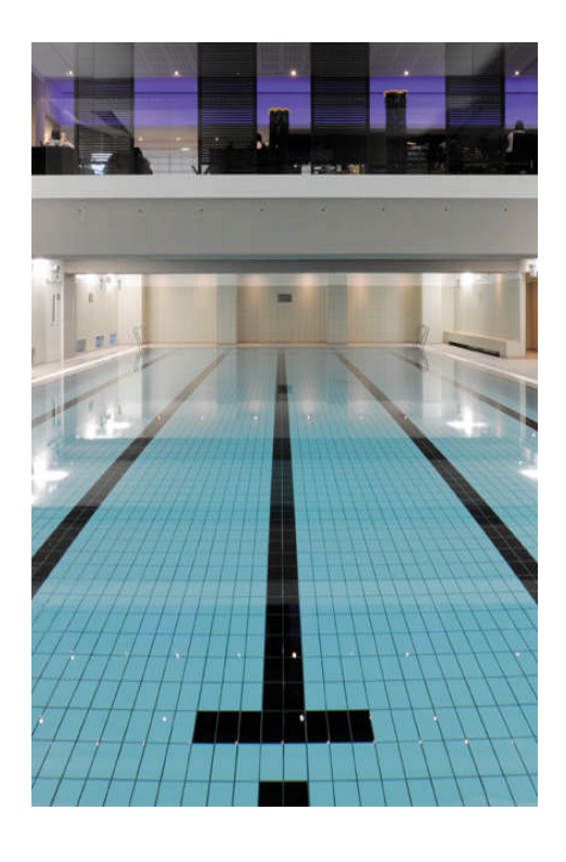
Ely Leisure Centre