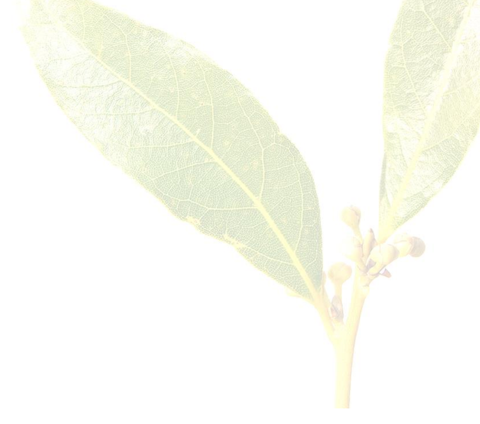
Tree Strategy – page 27

The Tree Strategy will be subject to a full review every 10 years.