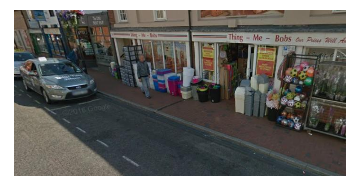
Image 4: In this image the taxi is the first car on the rank. The white markings delineate the 30 minute parking bay.

3.7.6 The impact of this action by Officers resulted in further pressure being added to the existing parking/ waiting arrangements in Market Street, with an increase in taxis using the small 30 minute free parking bay situated immediately in front of the existing rank (Image 4). This usage is confusing members of the public who see a parked taxi in this location and approach the vehicle believing it to be the first vehicle on the rank, which in turn is creating a large degree of tension within the taxi trade from those who have waited patiently for their turn on the official rank.