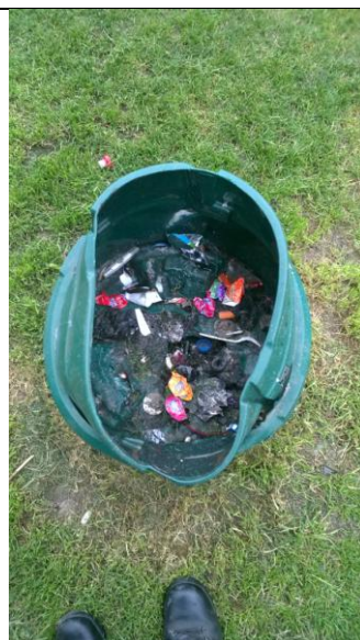
Burned out litterbin