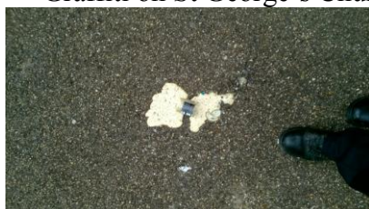
Smashed glass and spilt liquid on Church Porch