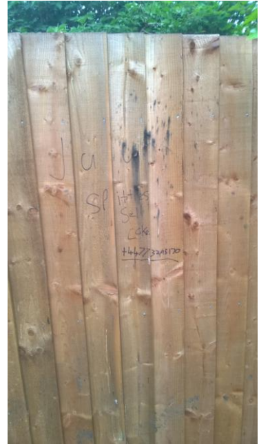
Graffiti on nearby fence