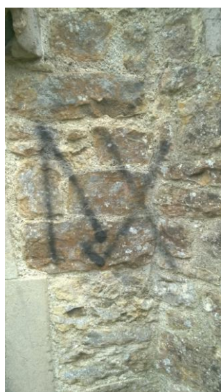
Graffiti on St George's Church