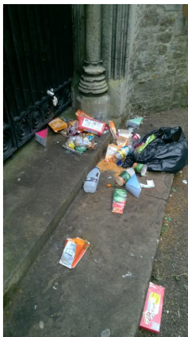
Garbage dumped on Church Porch