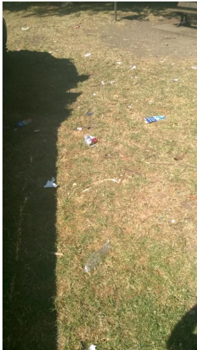
General litter and detritus