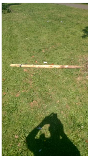
Vandalised tree stake