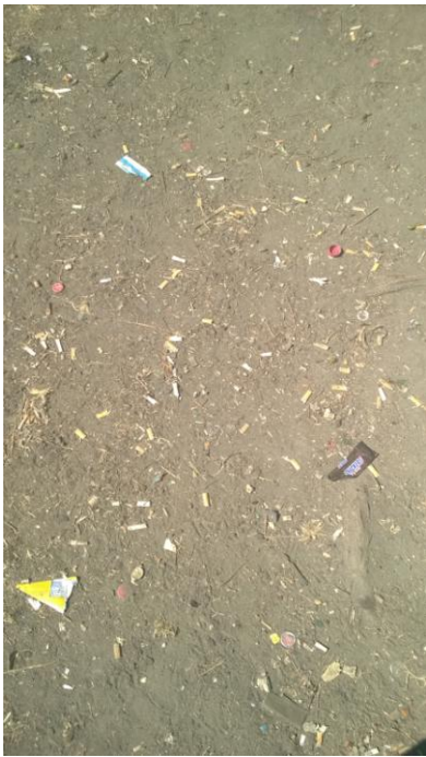
Discarded cigarette butts litter