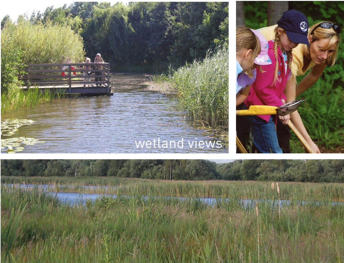
Wetlands - reedbeds and pools, pathways and bridges define the fen island margins