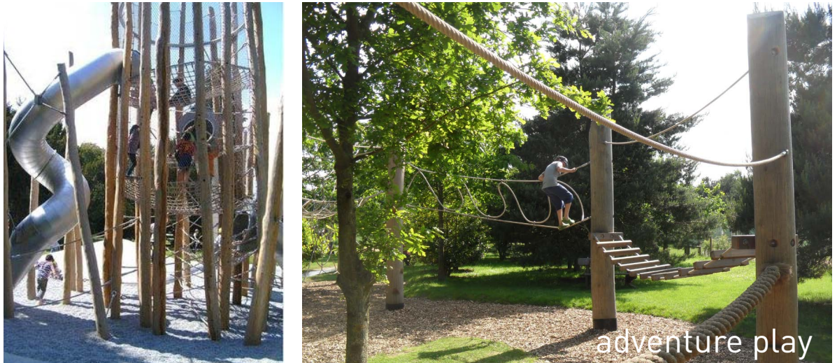
East entrance - car park, interpretation and adventure play