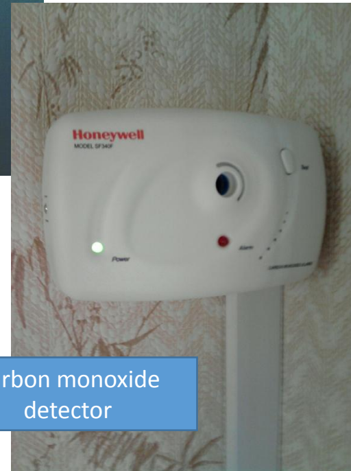
Carbon monoxide detector