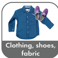
Clothing, shoes, fabric