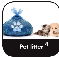
Pet litter 4