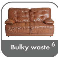
Bulky waste 6

These items can be taken to the HRC. 5 Please check www.cambridgeshire.gov.uk/hrc for the opening hours, acceptable materials and permit requirements for commercial-like vehicles and trailers.