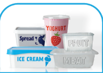
Pots, tubs, trays