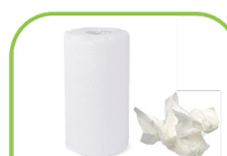
Kitchen paper and tissue