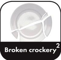
Broken crockery 2