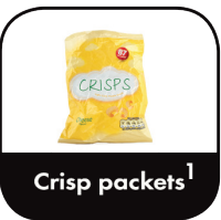
Crisp packets 1