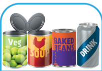
Tins and cans