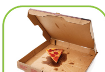
Dirty food cardboard