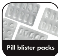
Pill blister packs