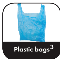
Plastic bags 3