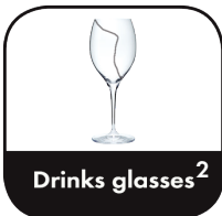
Drinks glasses 2