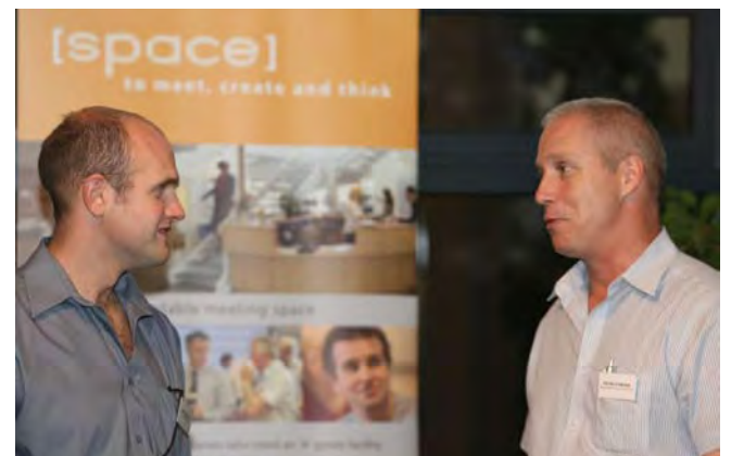
Business tenants of E-Space.

The successful e-space business centres in both