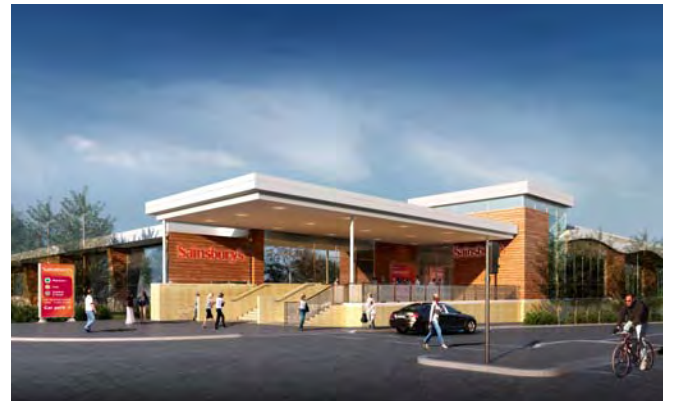
Artists impression of the new store.

If you have been along Lisle Lane in Ely recently you will have seen the building works for the new Sainsbury supermarket. The store is scheduled to open in mid February 2012 creating between 300-350 jobs and will provide some 4,000 sq m of new shopping facilities as well as 454 parking spaces.