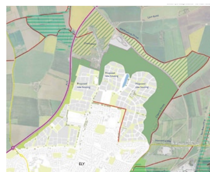
Figure 3 - Local green infrastructure context