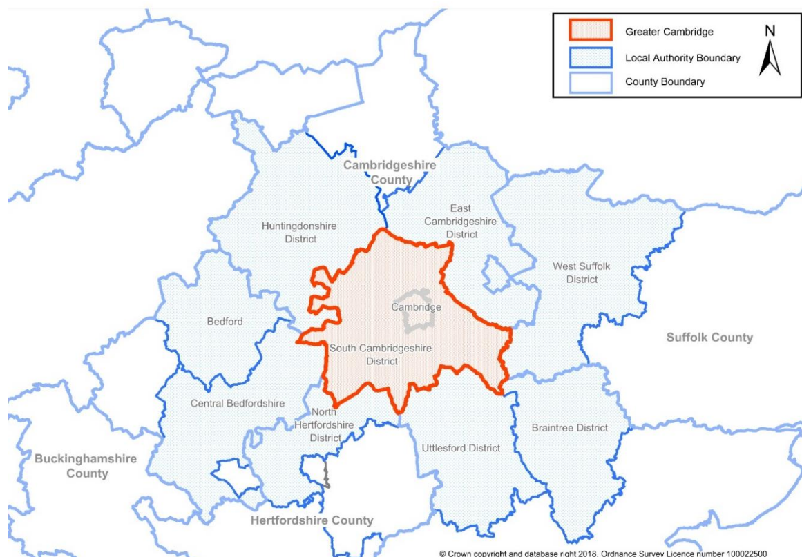
Figure 1: Strategic context – adjacent local authorities

Greater Cambridge is a two-tier area, with Cambridgeshire County Council providing many public services including education, highways and adult care.