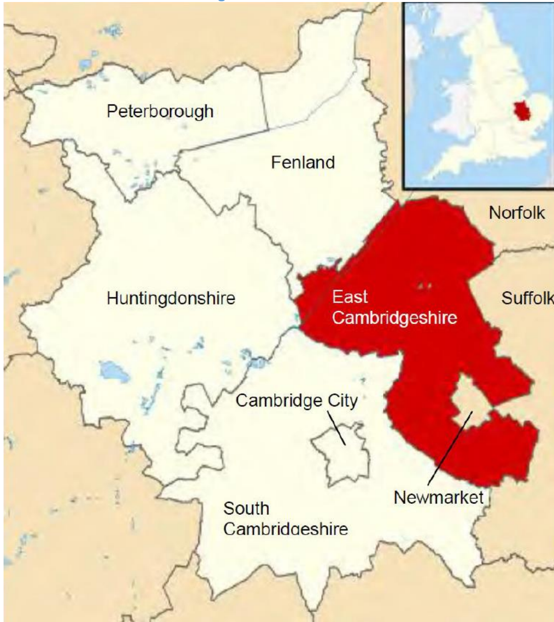
Figure 1 – The District of East Cambridgeshire