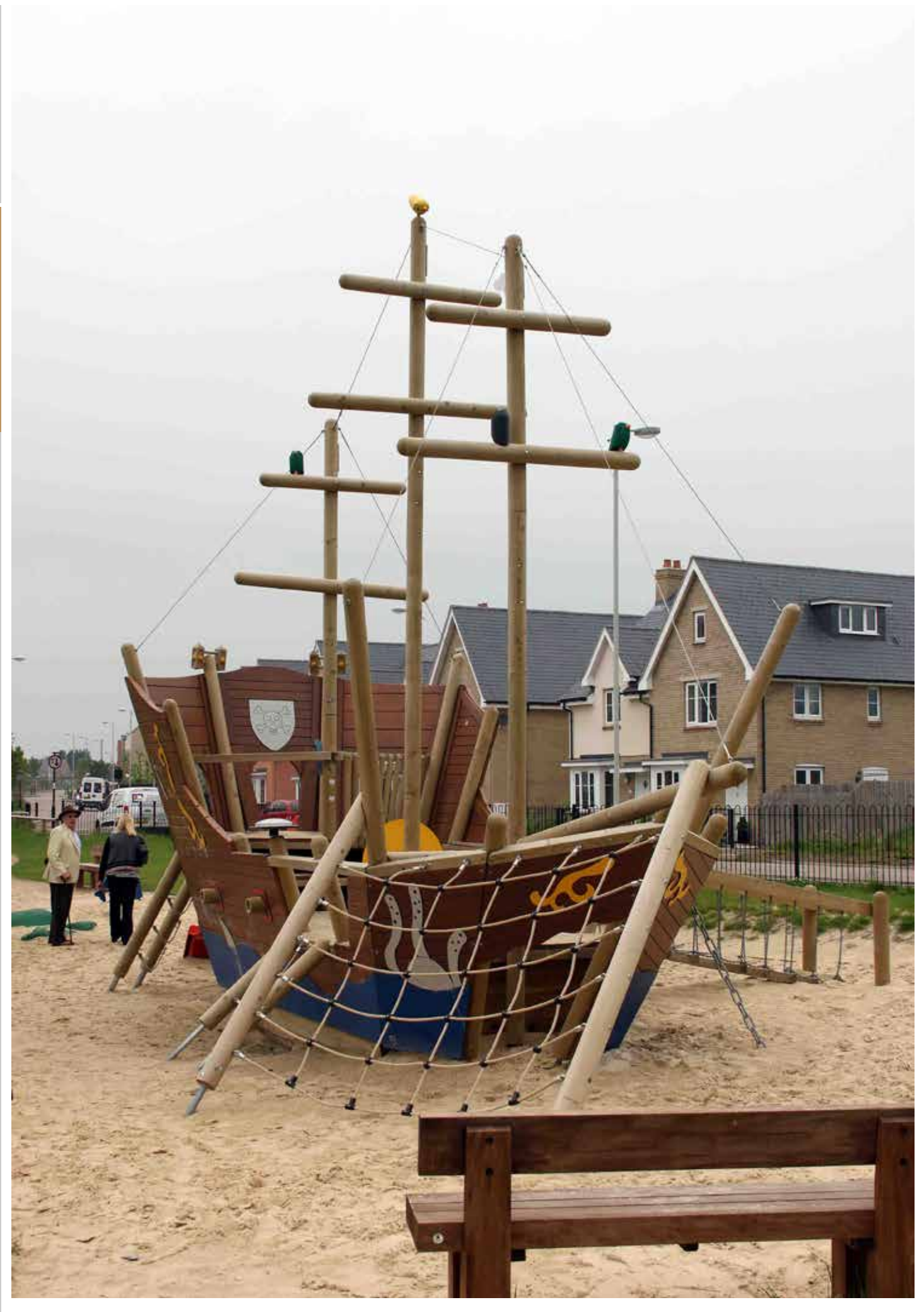
Adventurous play area, Loves Farm, St Neots, Cambridgeshire