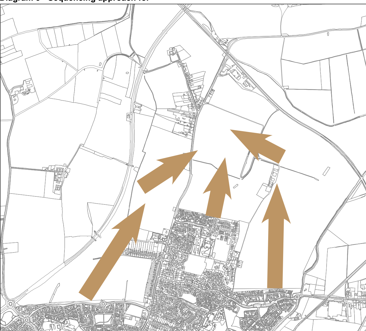
Diagram 3 - Sequencing approach for