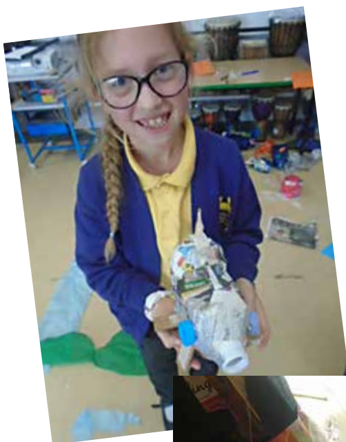
Pupil from Lantern School

We have been working with local schools and community and voluntary sector groups on educating them about waste and recycling. As you know, our resident recycling super hero Michael Recycle has been zooming in to various areas across East Cambs telling people what they can and can't recycle and helping to encourage more people to actively get involved in reducing the amount of rubbish that goes to landfill. He has also been visiting local school children.