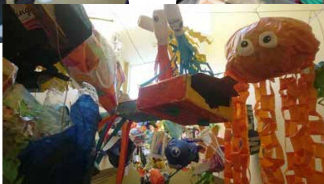
The finished installation at the Lantern Primary School