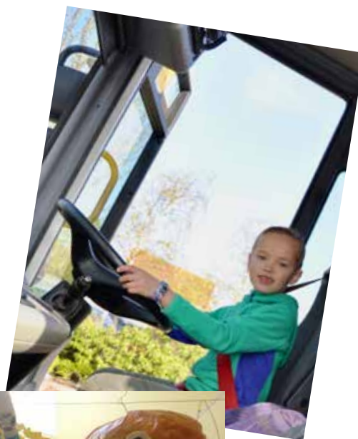
Lantern Primary School waste and recycling education project